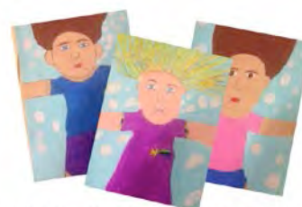
HOLDING OUR BREATH ARTWORKS

To relate to our visual literacy theme we have been completing artworks with an underwater theme. Here are some of the brilliant examples.