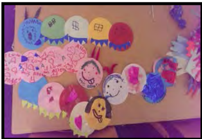
We used pipe cleaners and coloured paper to create our colourful caterpillars.