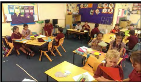
Working together helps us create our very best works of art.