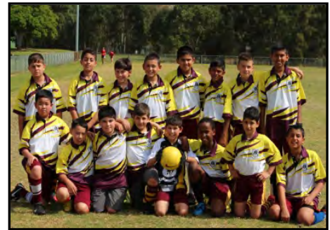
Prestons Boys Soccer team