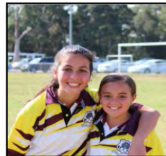
5/6T a class of best friends!