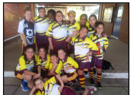
Prestons Girls Soccer team