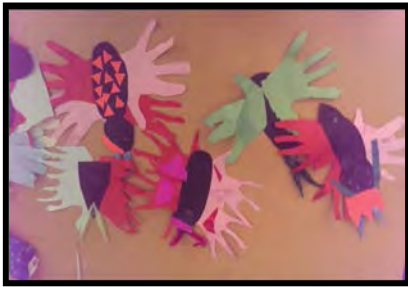
Our beautiful butterflies made from scrap paper.

In 2N, we believe that art is an essential part of our learning. During art lessons, we work individually or with a partner to create masterpieces. Some of our finished works of art include frogs, caterpillars, butterflies and more recently - reminders (to begin the Christmas season). We like to consider ourselves quite creative as we use lots of basic supplies like crayons, coloured pencils, Texas, paint, coloured and scrap paper as well as craft accessories. We have had a very enjoyable term so far and know that it's only going to get better.