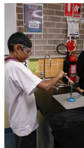
Our Scientists at work!